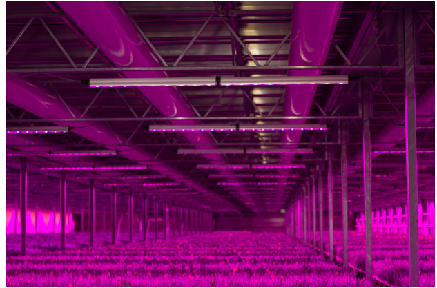
FL100 installation in Holland