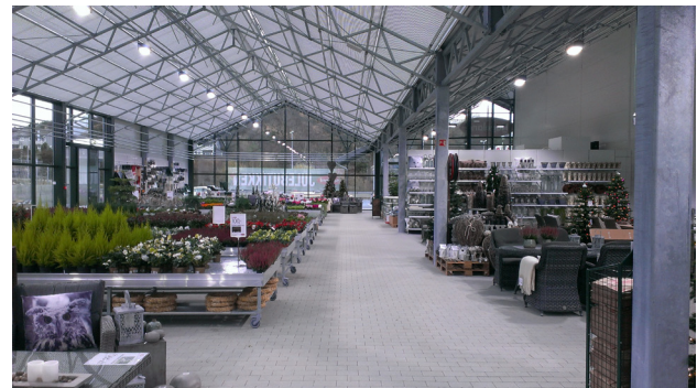
FL100 Sunlight installation in a Garden Center in Norway